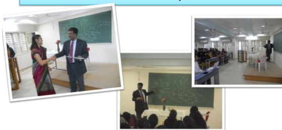
Lecture on Metabolic pathways and some basic principles of biochemistry.