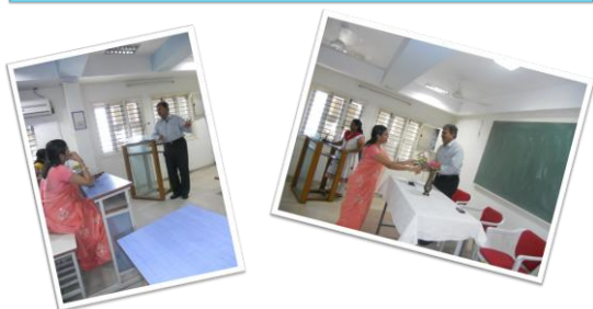
Interactive talk on Research.