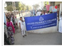
Jagrut Mahila Sangathan on International Women's Day a Rally