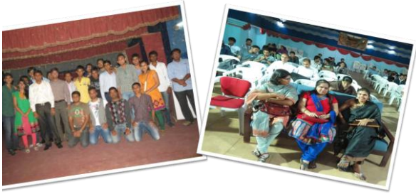
Alumni of APC Anand Pharmacy Alumni Association (APAA)