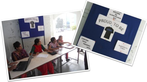
Alumni t-shirt campaigning