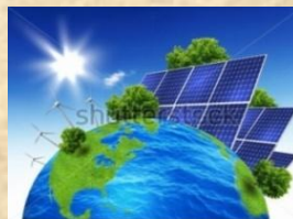
(B) Energy & Its applications