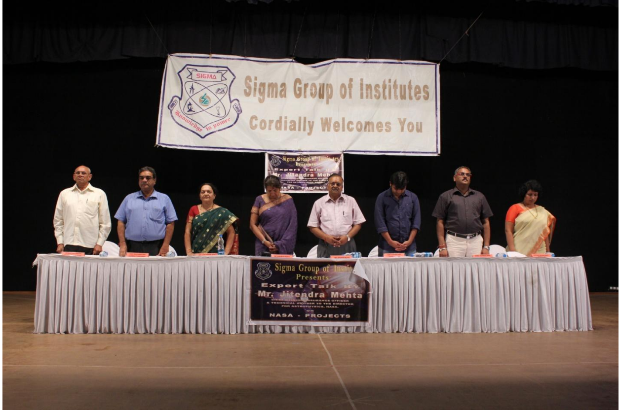
Dignitaries paying condolences to the Late mother of Shree Jitubhai Shah