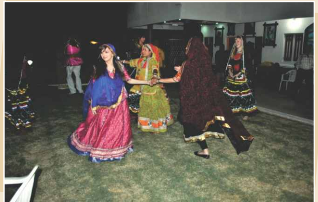
German students in Rajasthani traditional outfit