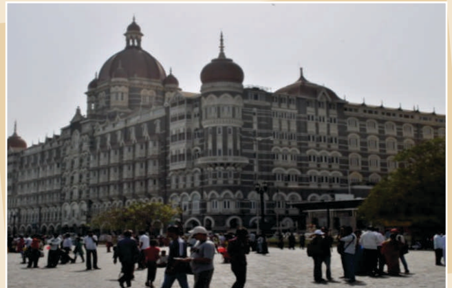
German delegates at Hotel Taj Residency