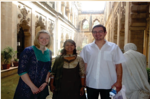
German delegates in Laxmi Vilas Palace