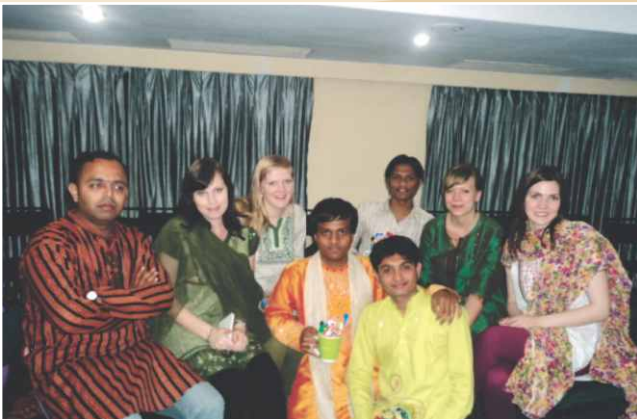
German as well as Indian delegates enjoying the Farewell party

In the evening, the students from German side as well as the students from Parul Institute of Management had a get together along with the faculties from both sides in traditional outfits in a seminar hall at Sayaji Hotel.