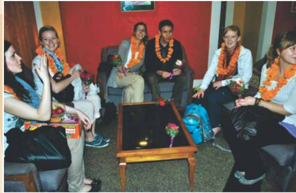
The group at Sayaji Hotel