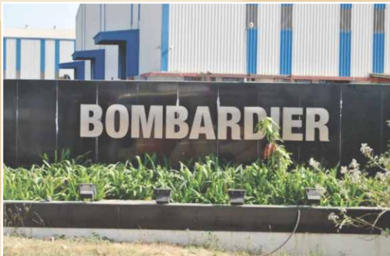
Industrial visit to Bombardier, Manjusr GIDC

On 5 th March – The German group along with two Professors from Parul Institute of Management and three student coordinators went for Industrial Visits at General Motors at Halol and Bombardier at Manjusr GIDC.