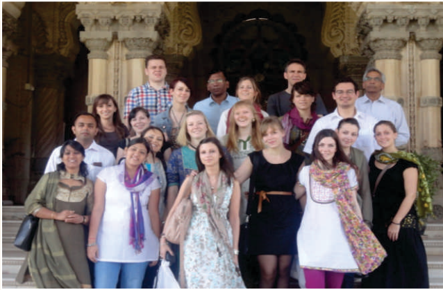
German delegates and Parul Institute coordinators at Laxmi Vilas Palace

On 10 th March – The group visited Maharaja Sayajirao's official resident “Laxmi Vilas Palace”. They were impressed with architecture and precious material used in the palace. They bought some of the handicraft gifts for their friends and family from the shop at the palace. They had lunch at Sayajirao Golf club with pure German dishes specially arranged. In the afternoon they left for Germany with memories of visit.