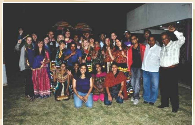
Students enjoying the cultural event