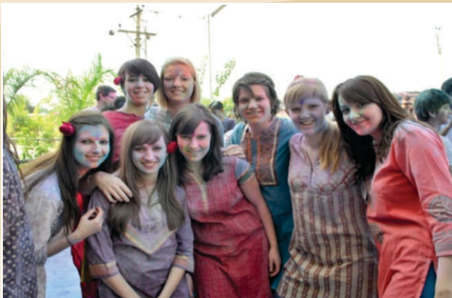
German students enjoying Holi celebration at Parul campus

On 8 th March - they were invited by Parul Institute of Management to play Holi with the students. Parul Institute had organized wonderful event for them. The German group had wonderful experience of Holi celebration. As per German group they had never enjoyed such kind of festival in their life and it became an unforgettable moment for them.