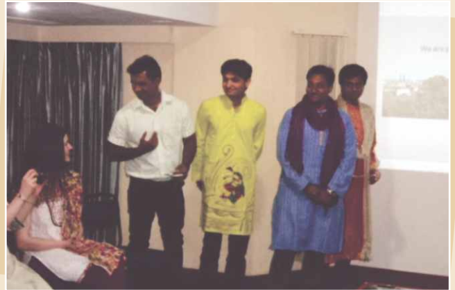
Students of Parul Institute interacting with German student