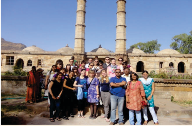
German delegates at Champaner Fort

On 9 th March - They had great privilege to visit Champaner . They went to Jami mosque where they visited various ancient heritages. They also visited Handicraft exhibition at Khadi Gram Udhyog. Some of the German students wrote Indian Post card to their Home from GPO, Vadodara. The students were back by afternoon.