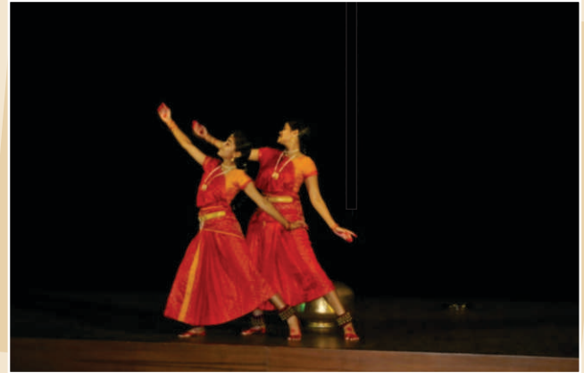
Students of Parul Group of Institutes performing in cultural event