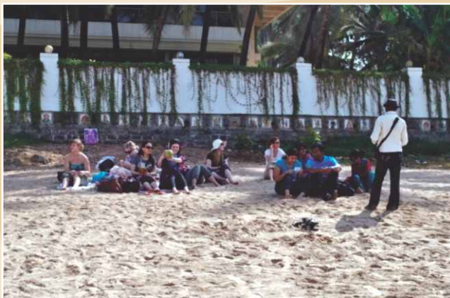
German delegates at Juhu, Mumbai

On 4 th March – In the morning they visited the Juhu beach where they enjoyed the beautiful sea shore of Mumbai. Afterwards they visited Iscon temple where they were familiarized about the Indian culture and got the deep knowledge about the Lord Shree Krishna's divinity. Then they left for Vadodara on same evening.