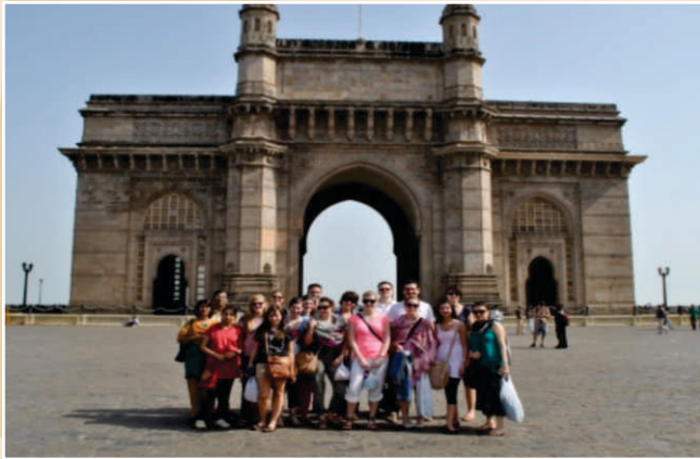
German delegates at Gate way of India

In the morning, they left for exploring various destinations of Mumbai; they visited Marine Drive, Hanging garden, Asia's largest fruit market and Colaba for the Shopping. They also had a visit of “ Gate way of India as well as HotelTaj Residency ”.