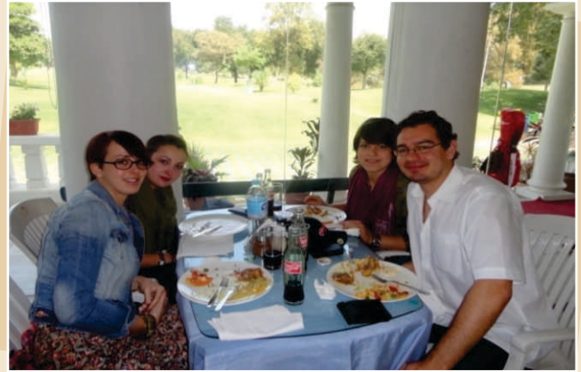
German students enjoying the food at Sayaji Golf club