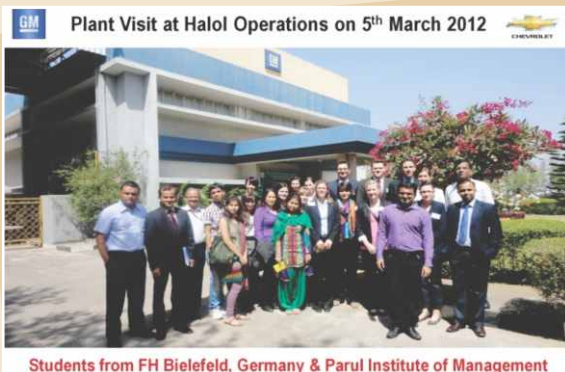
Students from FH Bielefeld, Germany & Parul Institute of Management