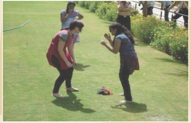
Students of both the institutions playing various games during the Holi celebration

In the evening, students from both the sides went to watch a movie based on Principles of Gandhiji “Lage Raho Munnabhai” . The whole day ended up with the great celebration.