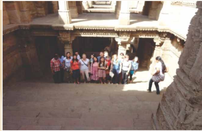
Visit of Adalaj Step well, Ahmedabad

Next, they went to Akshardham, Gandhinagar . It took almost 3 hours to visit whole place. At Akshardham, they enjoyed many shows which gave them the information about Swaminarayan religion. They visited museum of Akshardham where Indian history was very well demonstrated through photographs. There they got a brief idea about the epics like Ramayan and Mahabharat. After visiting the whole place they returned to Sayaji Hotel, Vadodara. They reached Vadodara at 11 pm.