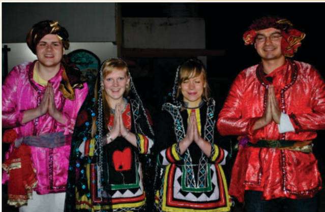
German students enjoying “Garba”

In the evening, students from both the sides went to watch a movie based on Principles of Gandhiji “Lage Raho Munnabhai” . The whole day ended up with the great celebration.