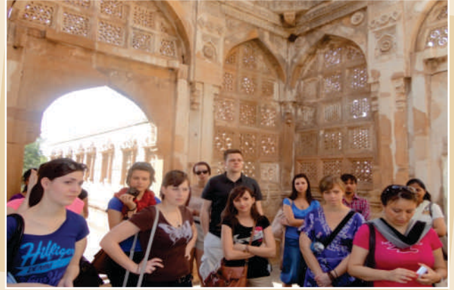
German students at “Jami Mosque”