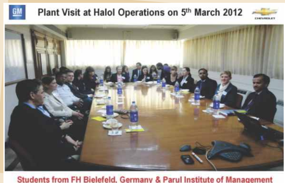
Students from FH Bielefeld, Germany & Parul Institute of Management