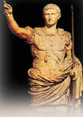
The Best Manager