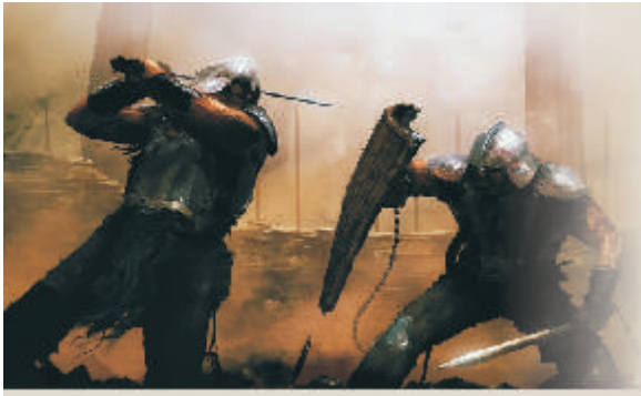
The Quiz Competition