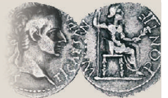
The Finance Battle