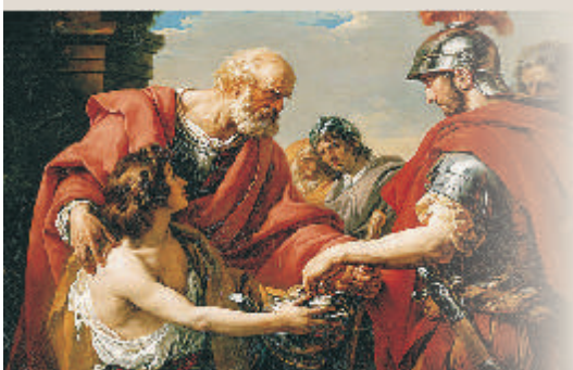
The HR Competition