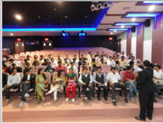
Faculty and Alumnus enjoying the gala moments after the lunch and are find playing games in a group and sharing the excitement