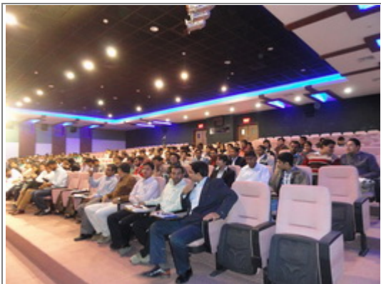
A very large presence of Alumnus (178 Nos.) is seen at the Auditorium for Inaugural function along with PIET faculty members.