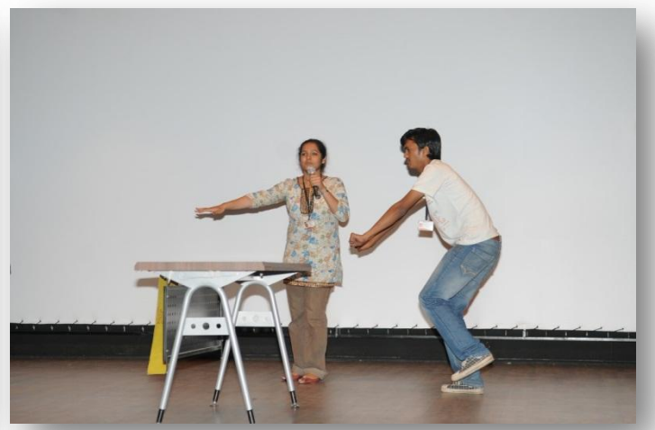
Students performing for Ad Reators