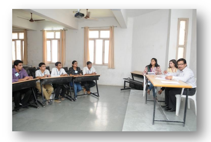
Group Discussion Round (Selection Demystified)