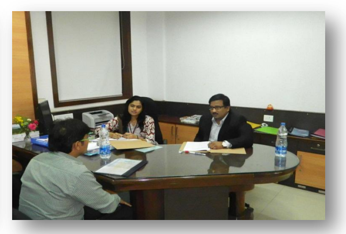
Personal Interview (Selection Demystified)