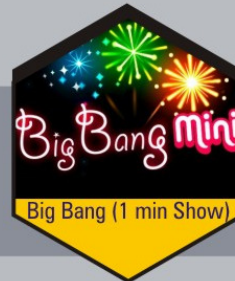
Big Bang (1 min Show)