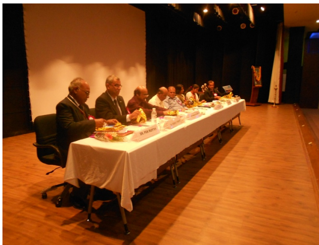
Dignitaries unveiling the souvenir of Xplore 2012

The addresses by the guests were followed by the unveiling of the souvenir of Xplore – 2012 by the dignitaries. The souvenir is a compilation of articles, poetries and paintings by the students of Parul Group of Management Institutes.