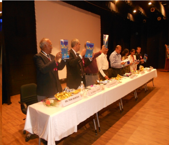
Dignitaries displaying the souvenir of Xplore 2012 to the audience

Then the guests were presented with a memento as a token of gratitude and appreciation.