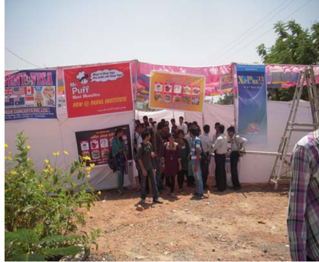
Students at Food Courts