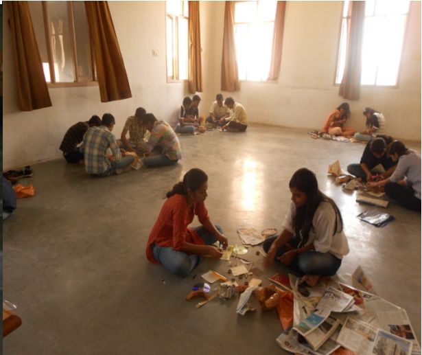
Participants making “best out of waste” – Art & Craft