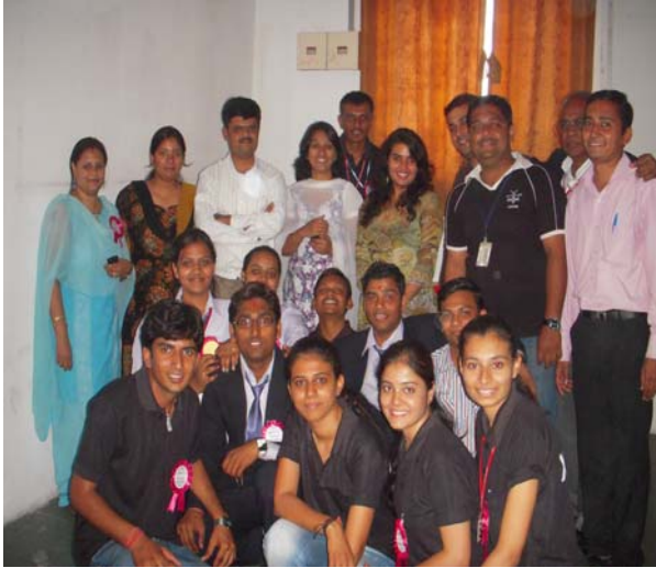
Group of Volunteers of Parul Group with External Jury Members after all events