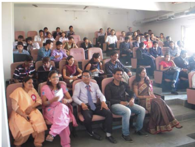
Participants and Event Coordinators at “ Movie Management “