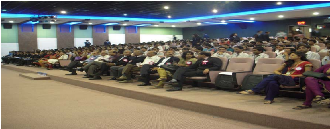
An Overview of Audience in auditorium