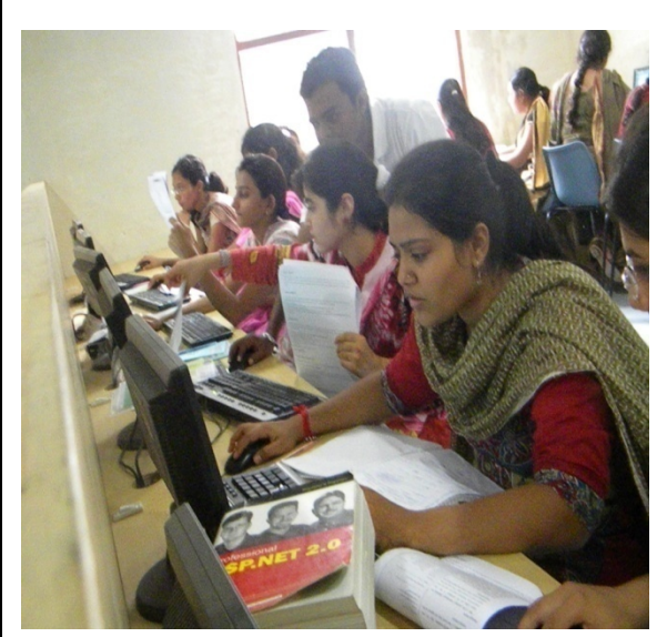
Delivered practical session on Android Application by iwillstudy.com