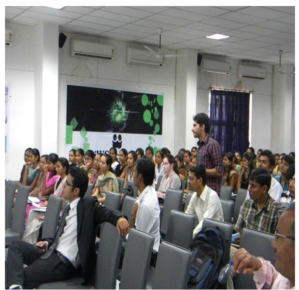
Brainstorming Session (Question-Answer)