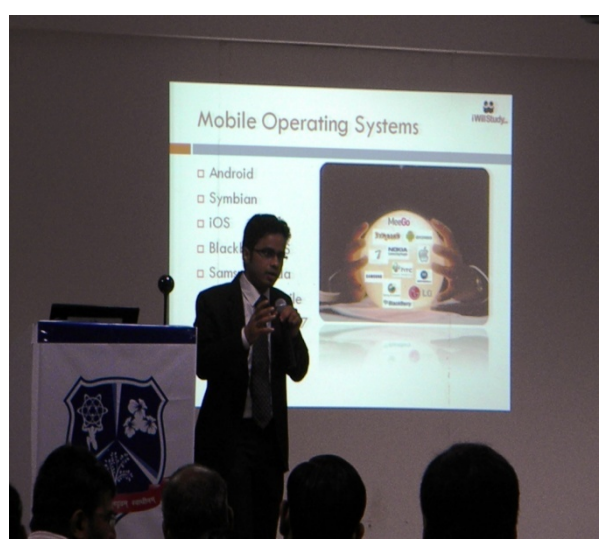
Important of Mobile Operating System