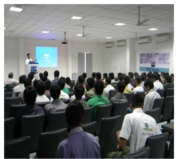
Addressing students on Android Application