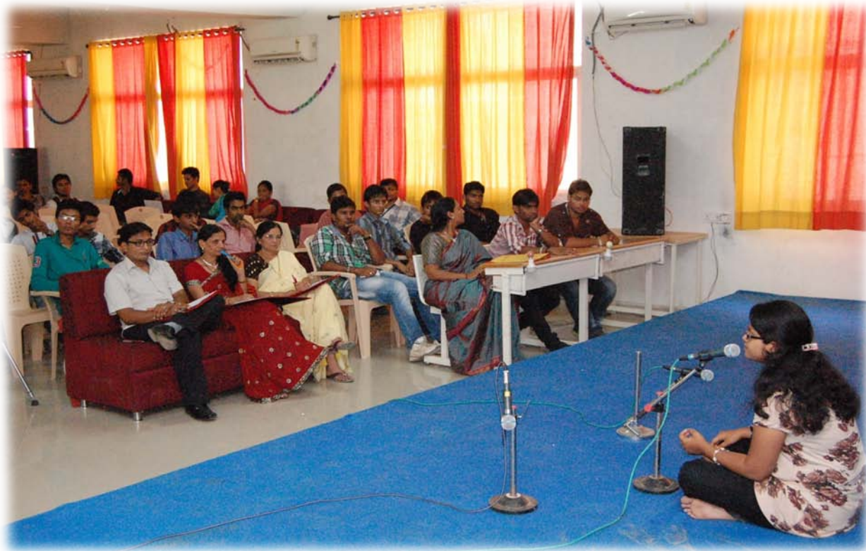
Light Vocal Solo