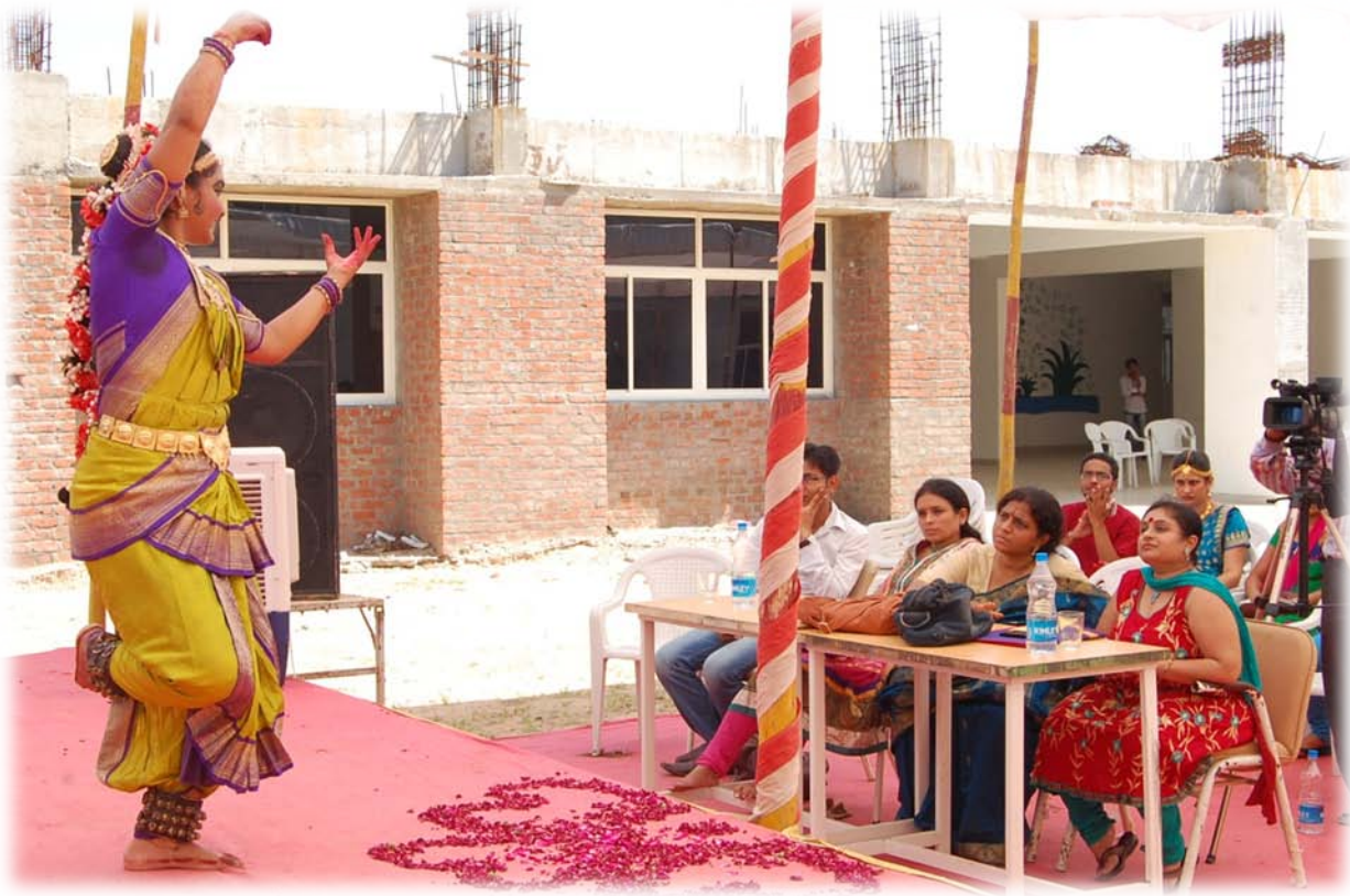
Classical Dance performed by the participants from various institutes