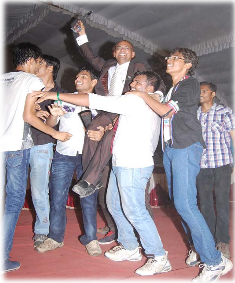
Runners up – Zonal