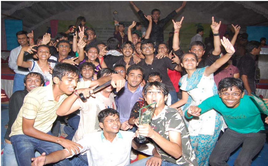
Winner - Zonal