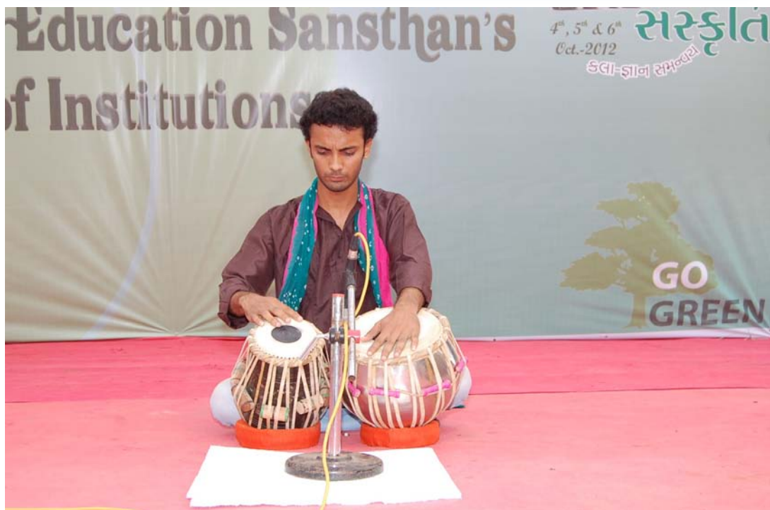
Classical Instrumental Solo (Percussion)