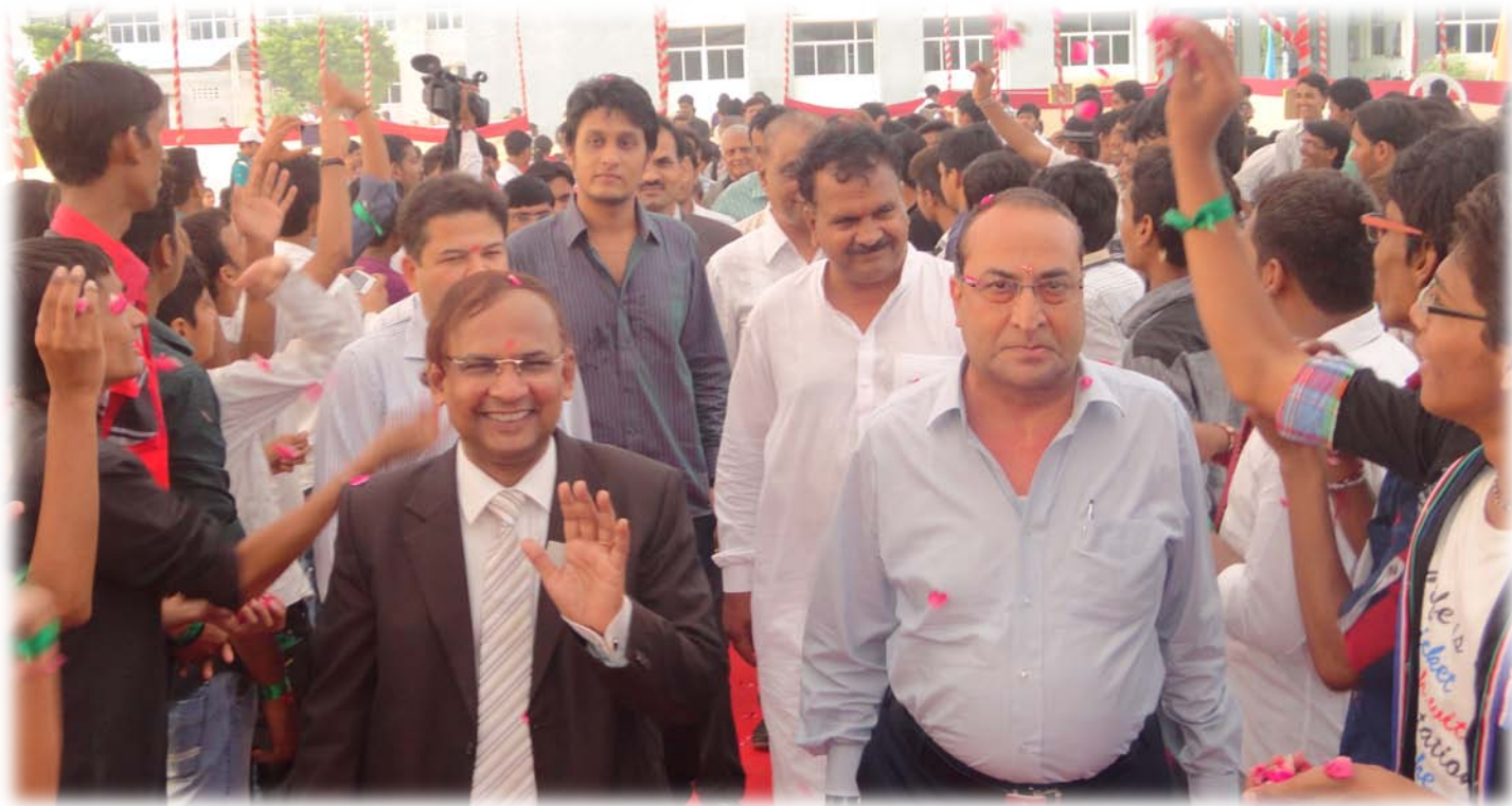
Participants of various colleges warmly welcoming the Dignitaries