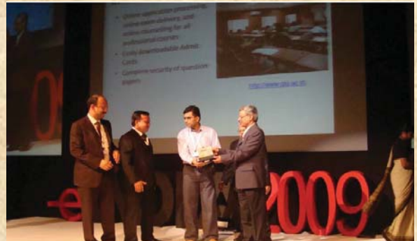
GTU bags the award for ICT enabled University of the Year in E India 2009

After the establishment of GTU a lot of improvements and changes are undertaken in order to revamp and technical education in the state. GTU has started a new method of examination and evaluation pattern for every semester. This entirely new concept has helped to mould the budding technocrats from a lump of mud to a very competent and sound profession. Gujarat Technological University has been awarded as ICT enabled university in the digital learning category which seeks to acknowledge and highlight the achievements of the institute in bringing new and innovative endeavors for the benefit of the higher education community.