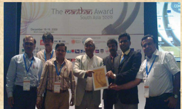
GTU wins Manthan Award 2009

It aims to involve the industries, along with the students and faculty members, in an innovation campaign, whereby GTU rejuvenates technology education and develops quality research at the University and helps create a culture of design, new and improved products and processes in our industry. The Council targets to create a management system, which uses the existing structures and facilities by bringing them together for working for innovation. The council has decided to document every single success and to make the information available to all the stake-holders to develop self-confidence in the whole of the system.