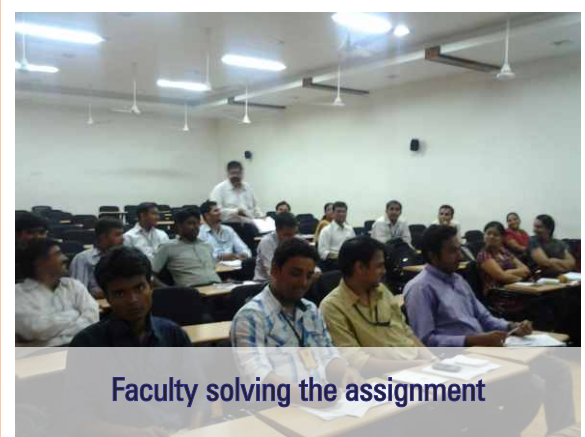
Faculty solving the assignment