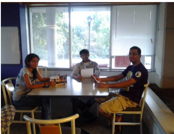
Students planning at the front lobby