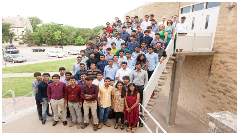
Group Photo After Breakfast on June 27,2013 at Derby Dining Hall

The lecture hall and residence hall are at walking distance. Students started attending lectures as per schedule. The library facility with large number of computers, wi-fi enabled photocopier and scanner, automated moving racks for saving space have been found to be interesting features of the library. The recreation center at the campus has remained as most attractive place to visit by the students every evening.