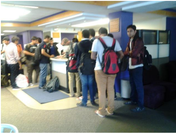
Students checking in at Front Desk of West Hall