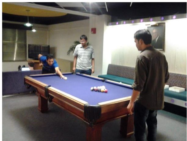
Students playing pool and relaxing after heavy assignments