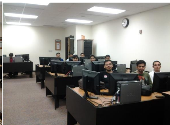
Students attending Class on First Day at Fiedler Hall