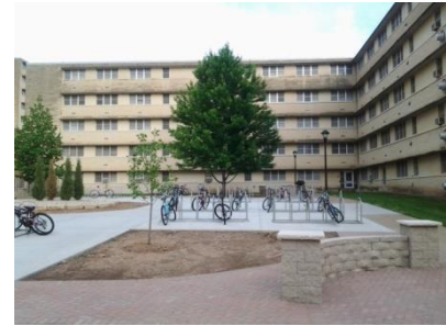
Resident Hall Side View and K-State Union Front View

On July 4, 2013, students visited Wamego Town to watch USA Independence Day celebration in a tour with a guide. The tour was facilitated by DEP, KSU and coordinated by Mrs.Kelli Fuhrmann.