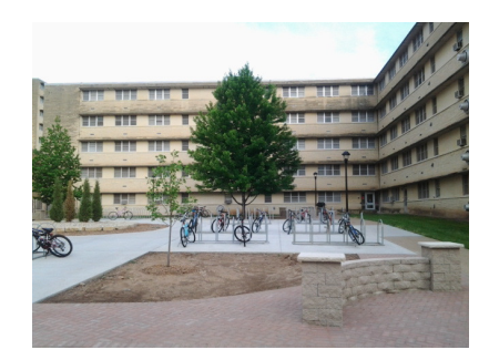
Resident Hall Side View and K-State Union Front View

On July 4, 2013, students visited Wamego Town to watch USA Independence Day celebration as a guided tour. The tour was facilitated by DEP, KSU and coordinated by Kelli.