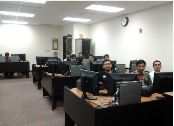
Students attending Class on First Day at Fiedler Hall