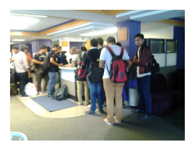
Students Checking in at Front Desk of West Hall