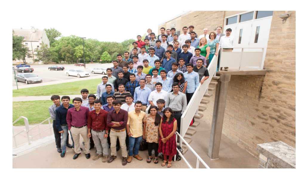
Group Photo After Breakfast on June 27,2013 at Derby Dining Hall

The lecture hall and residence hall are at walking. Students started attending lectures as per schedule. The library facility with large number of computers, wi-fi enabled photocopier and scanner, automated moving racks for saving space have been found to be interesting features of the library. The recreation center at the campus has remained as most attractive place to visit by the students every evening.