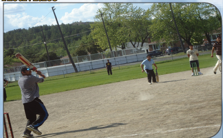
On the cricket ground