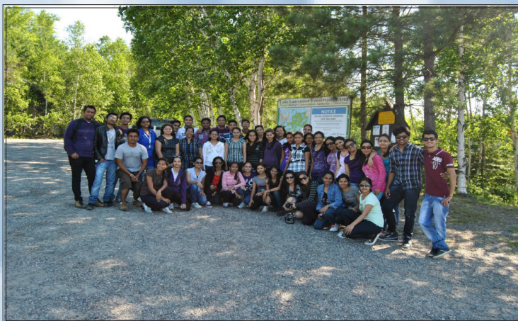
Trip to Laurentian Conservation