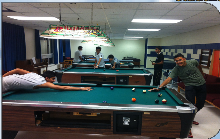
Billiard pool at the student residence