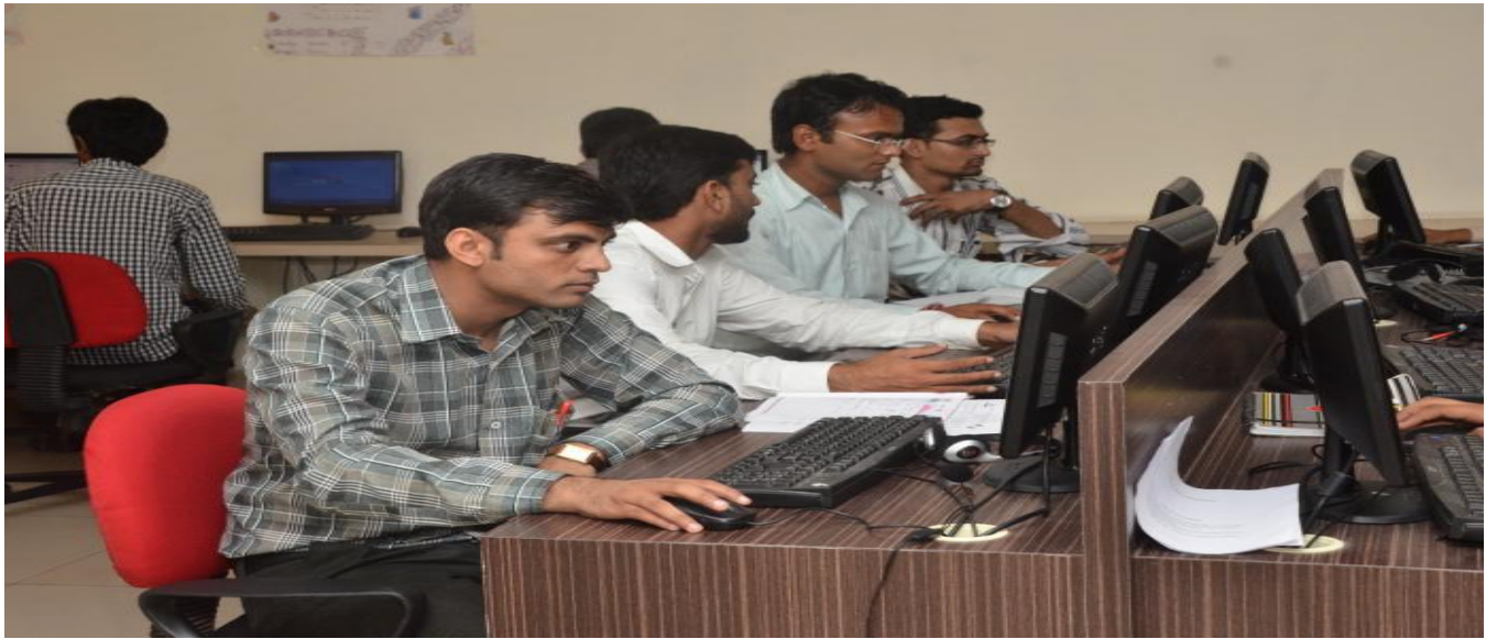
Glance at practical sessions of Faculty members on LATEX with the help of video tutorials.