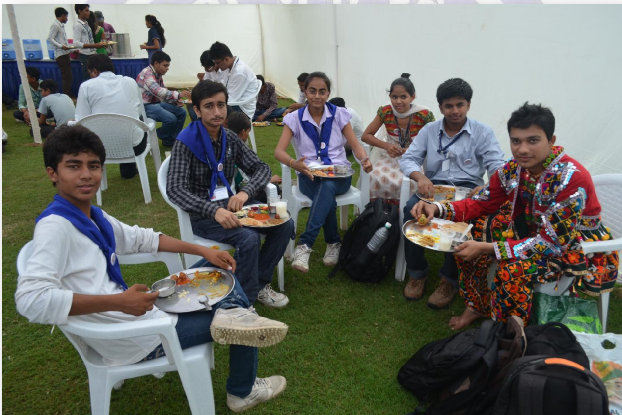
Volunteers at Lunch Session

The very first event was Group Dance Competition. It began with the very first group dance on the patriotic song “Desh Rangeela” presented by GTU NSS volunteers. Then two of the GTU NSS volunteers participated in PowerPoint Presentation based on CULTURE OF GUJARAT. In Traditional Dress Competition, volunteers coming from various regions represented their culture and traditions beautifully.