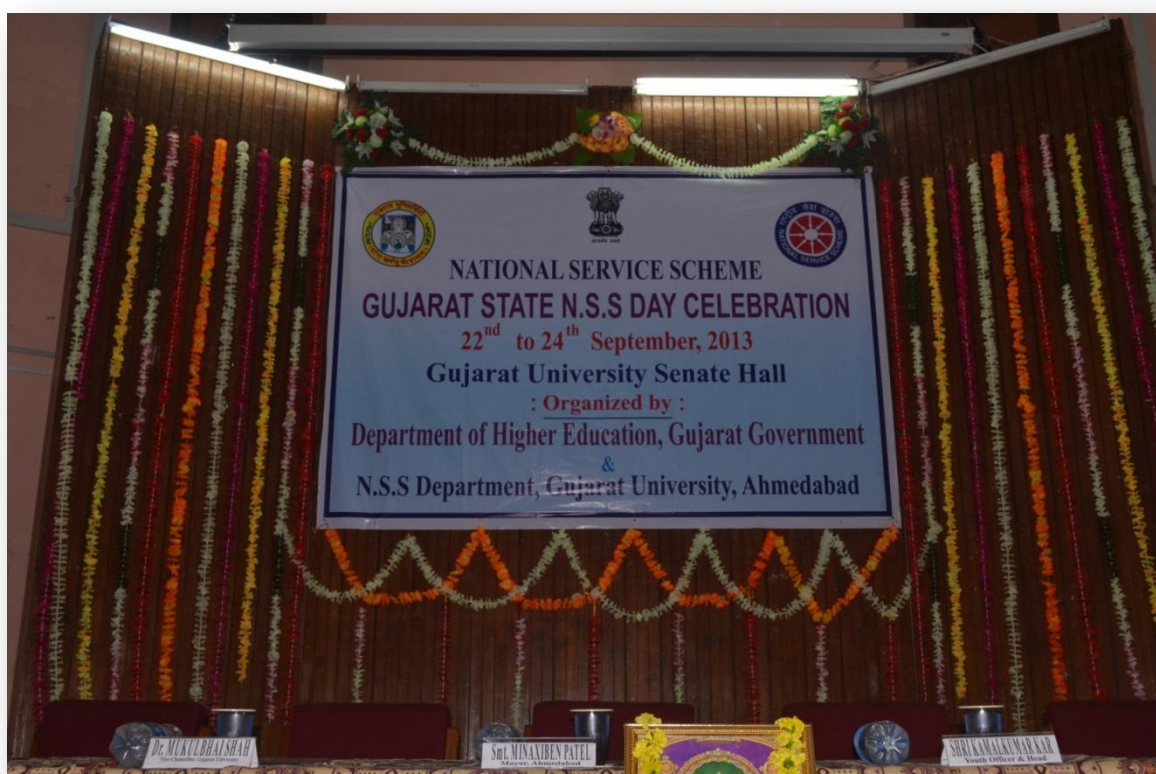
Senate Hall, Gujarat University