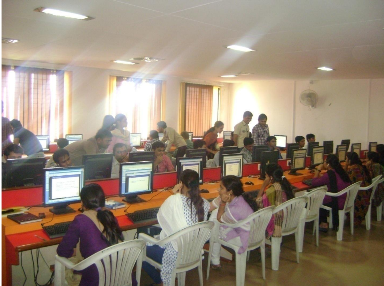
All staff members who attended the Awareness Event had participated Open Source Software “Latex” and appreciate it.