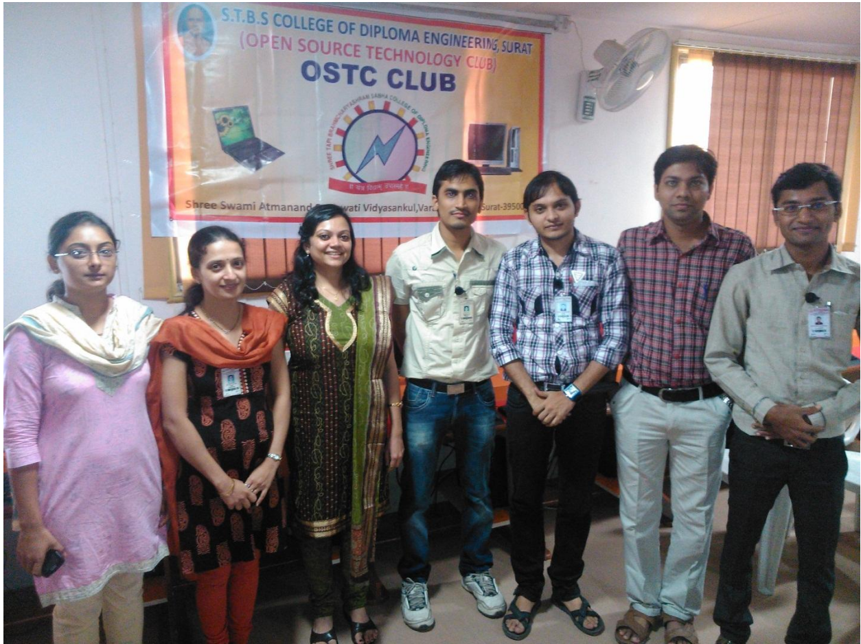
OSTC Committee members - S.T.B.S. College of Diploma Engineering, Surat.