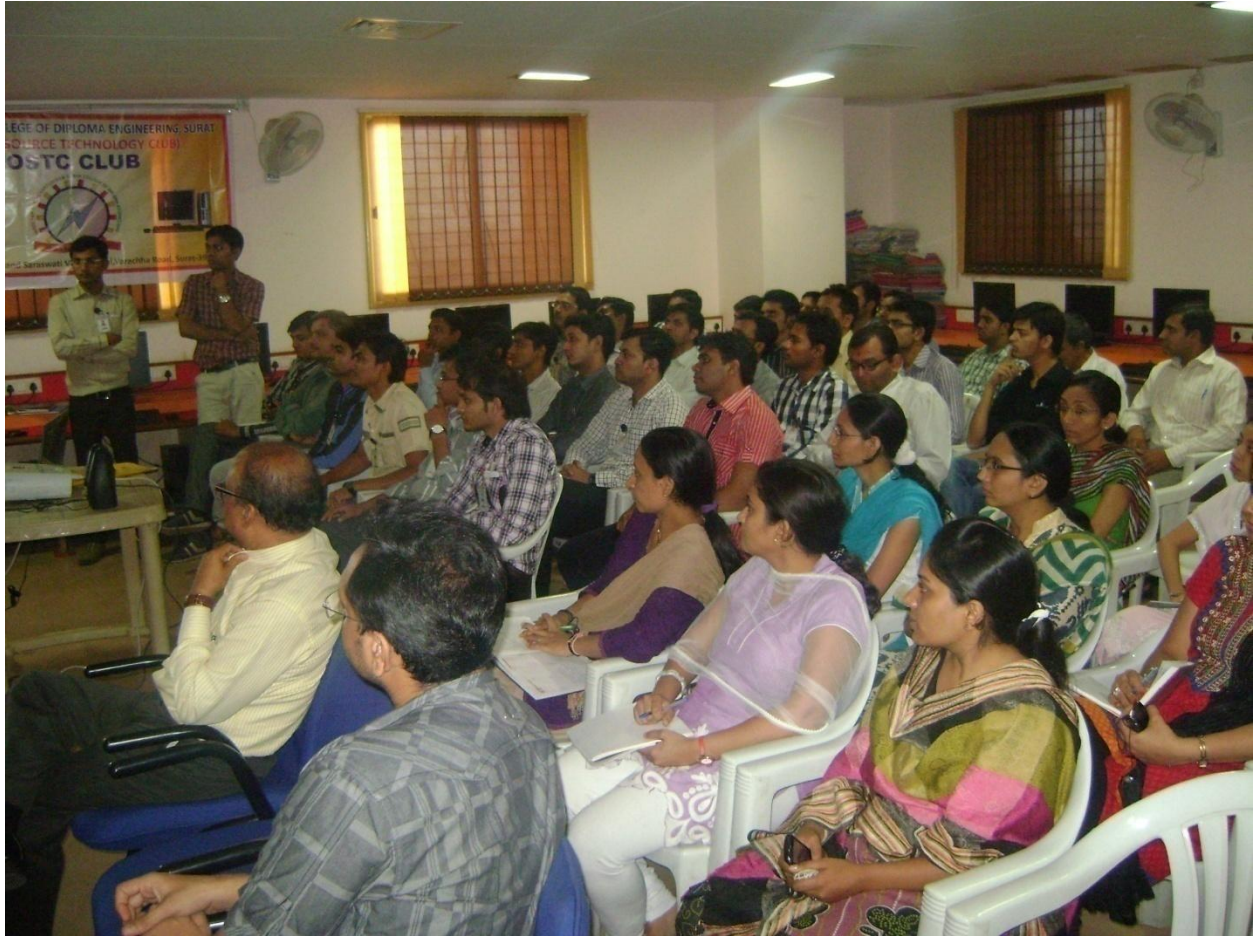
All faculty members attended an awareness event of OSTC club.