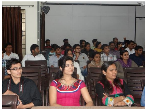
Report on "2 nd Annual Alumni Meet", Date : 8 th February 2014