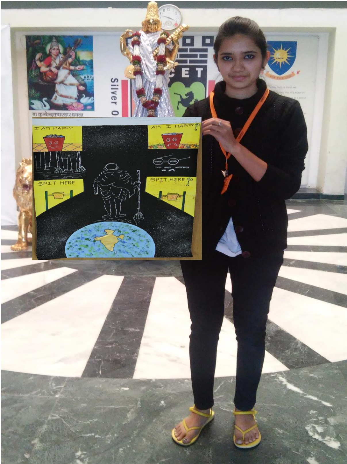
1 st Prize Winner of the Drawing Competition