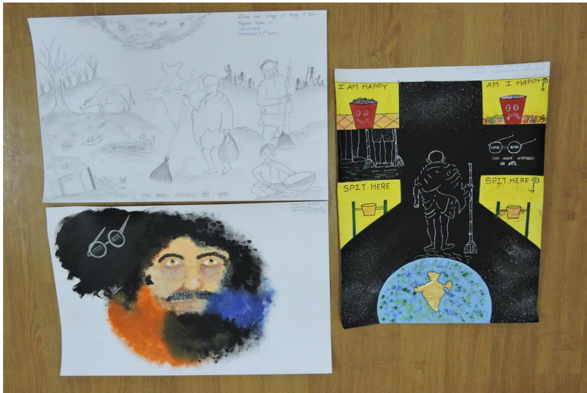
Paintings of 1 st , 2 nd and 3 rd winners of the Drawing competition