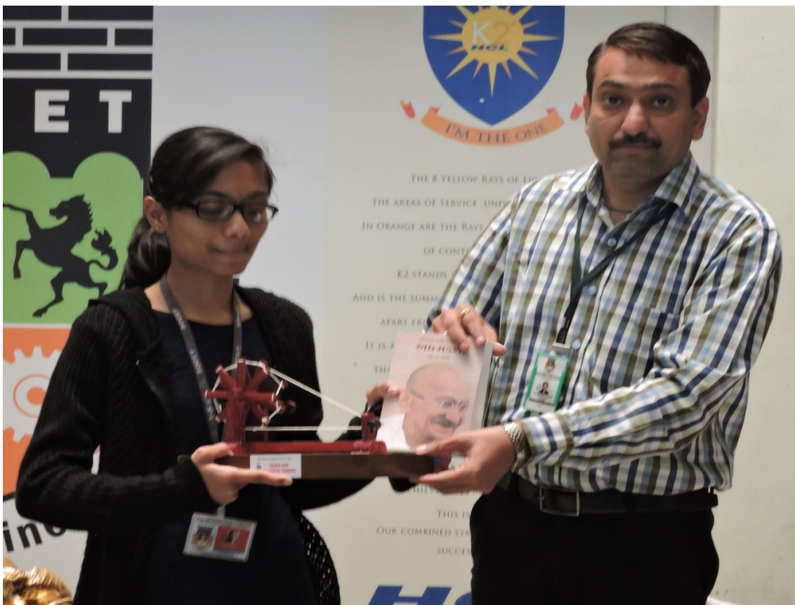
3 rd Prize Winner of the Drawing Competition