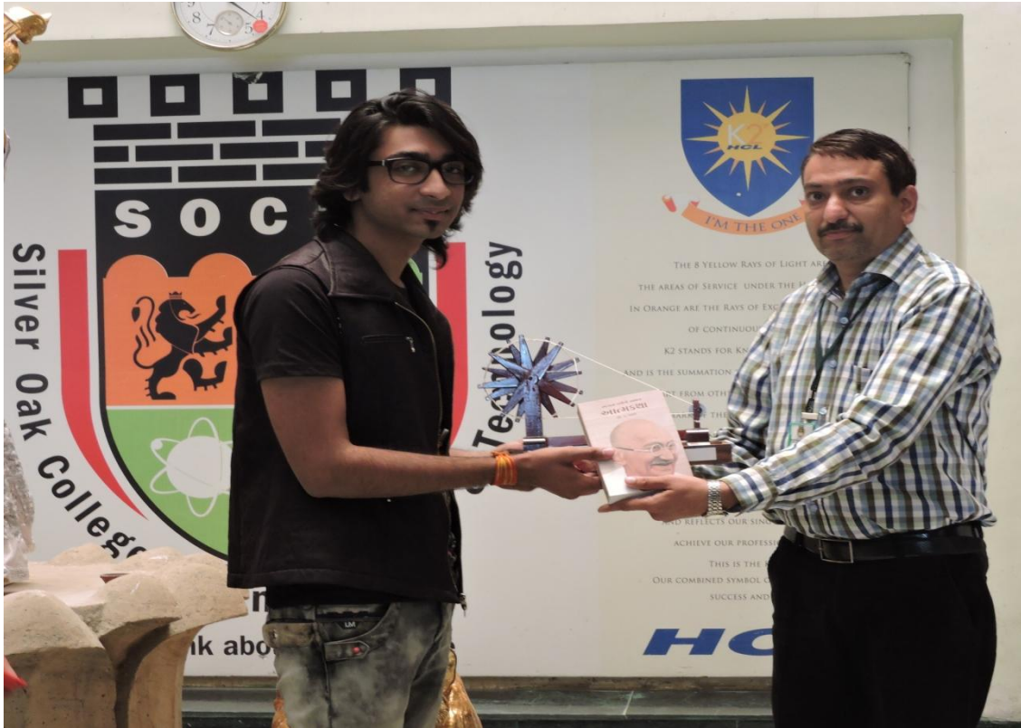
2 nd Prize Winner of the Drawing Competition