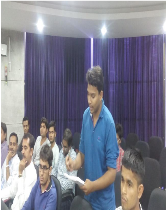
Participants interacting with Panellist