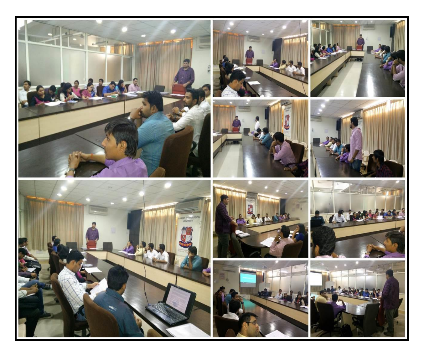
Picture: Roundtable with the students and GIC coordinators from L.J. Campus (IMS, ICA, MCA, IET)