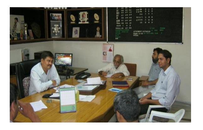
Team GTU Innovation Council members in a meeting with Principal and HODs at S.S. Shah College of Engineering, Bhavnagar.