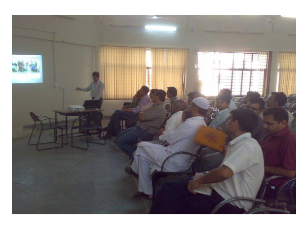
GTU Innovation Council members in a meeting with the Udisha Club members at Government Polytechnic, Godhra, Godhra Sankul.