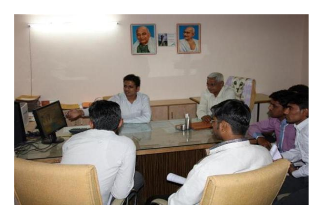
Meeting with students at Parul Institute of GTU Innovation Council members in a meeting with the Udisha Club members at Smt. R.S.Patel Insti. Of Diploma Engg., Shelavi, Patan Sankul.