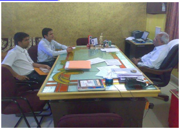
GTU Innovation Council members in a meeting with the Udisha Club members at Engineering College, Tuwa, Godhra Sankul.