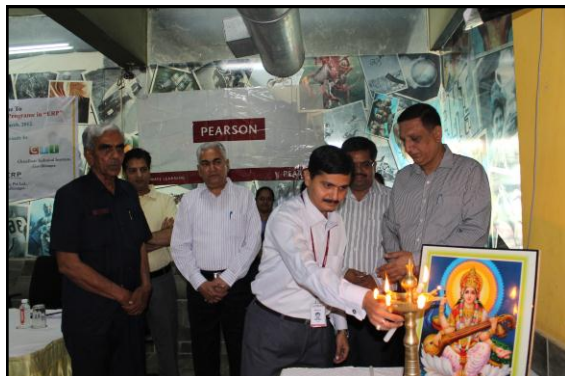
Lightening of Lamp at Inaugural Function.