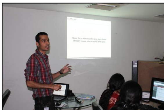
Technical Session in motion.