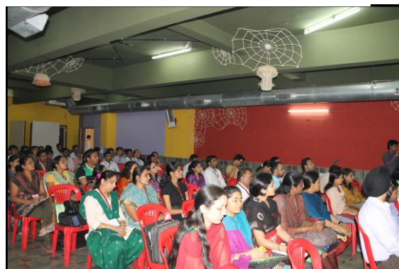
Audience at inauguration session.