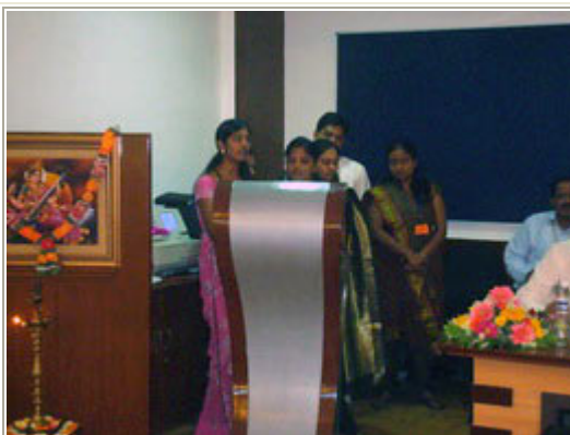
Prayer by girls and staff member at inaugural function of the Short Term Training Program on "Structural Elucidation of Organic Compounds Based on Spectroscopic Data"