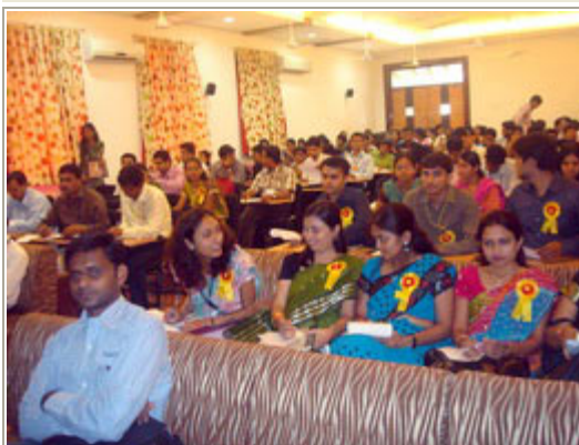
Participants and Guests during the the Short Term Training Program